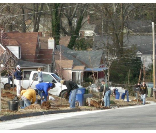
Volunteers planting trees along Rogers Avenue

Vines on trees rob trees of moisture, harbor invasive bugs, add weight to a tree, and catch the wind like a sail. All of which can lead to the death and falling of a tree. Cutting a three foot swath from the bottom of the vines at the tree's base upwards will rob the invasive vines of their water supply, causing them to wither and die. Spray Roundup on the cut portions of the vines to kill the vines at their base.