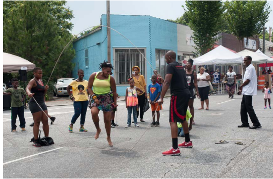
Summer Solstice Celebration 2015.

Support the WCO today! Contact Rebecca Cater for more information at 678-350-6927 or info@westviewatlanta.com .