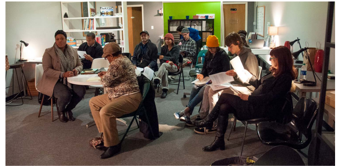
November 2015 Neighborhood Commercial zoning meeting.

A third meeting will take place on February 16, 2016, at 7:00pm at KIPP STRIVE Academy to go over the prior meeting's details and make any necessary last edits. Once the uses and district have been determined legislation will be written and introduced to City Council for a vote.