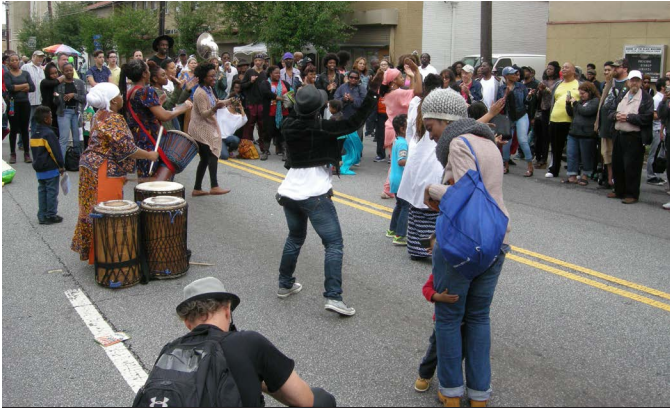
Atlanta Streets Alive 2015 in West End.