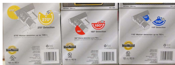
Security light options.

In consideration of range the lights are also marked with angle of coverage. Coverage of 240 degrees is good if you