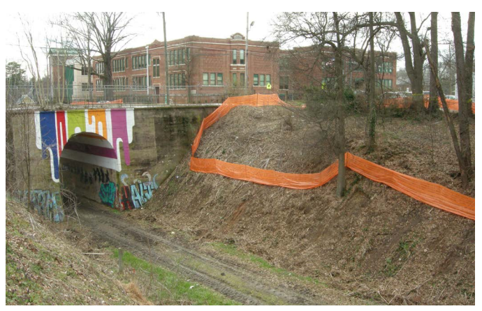
The Atlanta BeltLine path crossing with the Lucile Avenue bridge.

The project generally has been enormously successful, generating over $2.4 billion in private investment since 2005. Right now, the bulk of that development has been along the Eastside Trail, but there is momentum along every stretch of the corridor. More than economic impact, however, the Atlanta BeltLine has transformed the life of those neighborhoods by providing car-free access to shopping and restaurants, and a safe route for pedestrians and cyclists, including kids on their way to school. It is introducing an entirely new, healthy, and sustainable way of life in Atlanta.