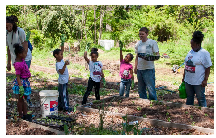
Pea planting at the Westview Community Garden, spring 2014.

The food from the garden goes directly to the community for free. Local businesses such as Westview Pizza Cafe and the youth will have a booth this summer at the West End Farmers Market. With additional funding, our chicken coop will start operating later in the summer.