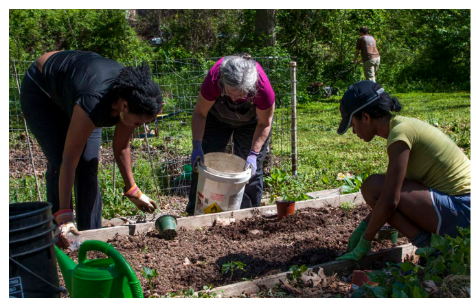
Pepper planting at the Westview Community Garden, spring 2014.

It's important for our neighbors that have been disenfranchised to see and learn how to grow their food... it's empowering!